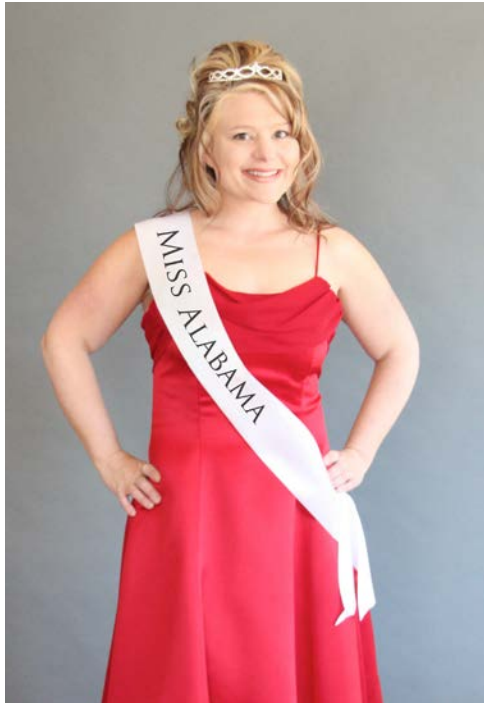
Sash made with 5" ribbon